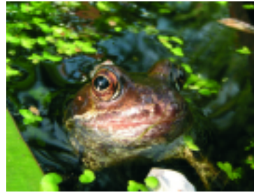
frog - R. Burkmar

Some plants are less vulnerable to attack than others. These include plants which are strongly aromatic, spiny, coloured red or have tough or hairy leaves. Vulnerable plants can be protected by a barrier of resistant plants. Ones to try include: Onions, Chives, Lavender, Sage, Rosemary, Thyme, Saxifrage, Ice plant, Lamb's lettuce and most shrubs