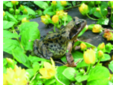
frog in creeping jenny - R. Burkmar

Do not water plants at night when slugs and snails are most active. Instead water early in the morning.