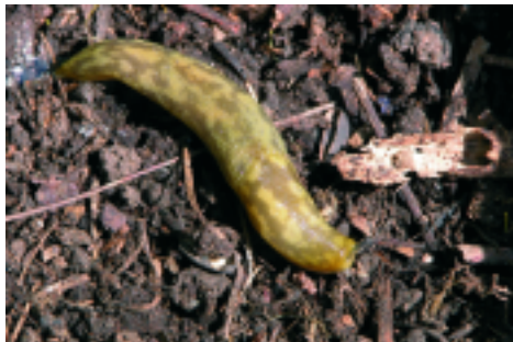
leopard slug -S. Tatman

A ring of sharp grit, crushed egg shells, pine needles, coffee, ash or soot around a plant can help keep slugs and snails away. A mulch of cocoa shell is also worth a try. The mulch will also suppress weeds and help retain soil moisture.