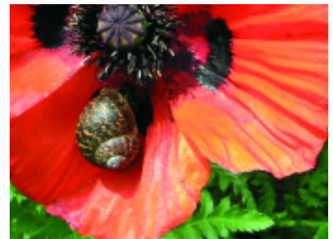
Garden snail in poppy

If you do not fancy wasting your beer (see opposite) here are some alternatives: milk, grapefruit juice or cabbage soaked in washing up water. Sounds horrible but they love it!