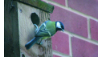
Blue tit

What's more, building bird boxes is straightforward and easy - no special carpentry skills are needed.